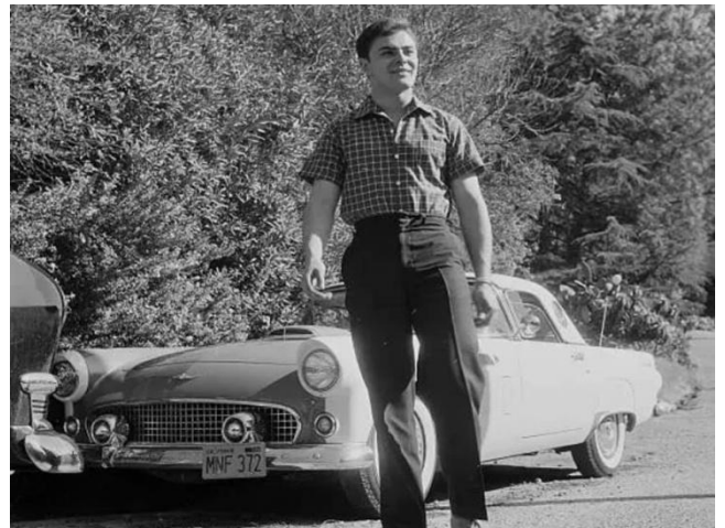
John Saxon (Nightmare on Elm St)