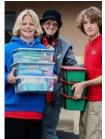
Above and above left: Operation Christmas Child boxes get loaded up for delivery.