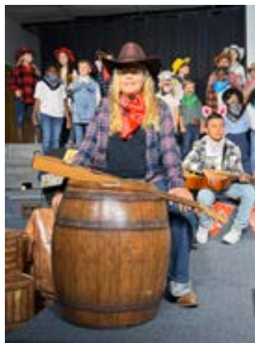
Below: Kindergarten through second grade Christmas program.