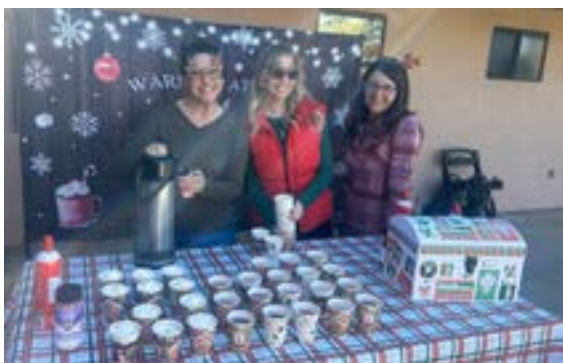
Above: PTF volunteers man the Hot Cocoa Bar!