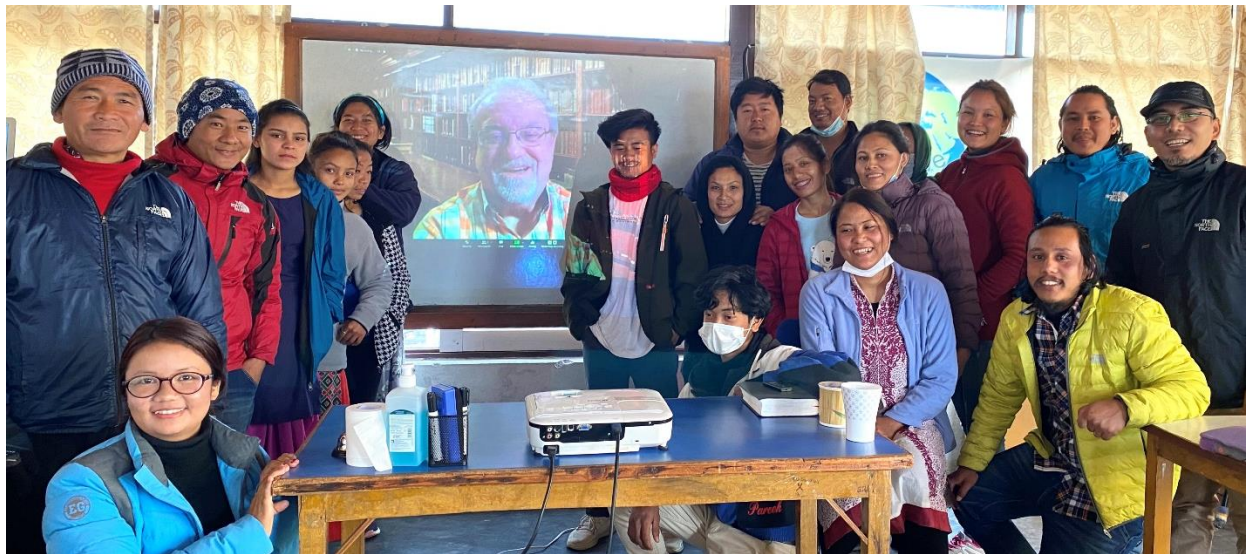
Here are my Nepalese students, and faintly, you can see my face on the screen in this posed classroom shot.

PM until 12:30 AM (not my best time of day), which meant that for the students it was the next morning starting at 7:00 AM.