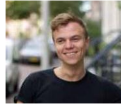
Evert-Floor, the Netherlands