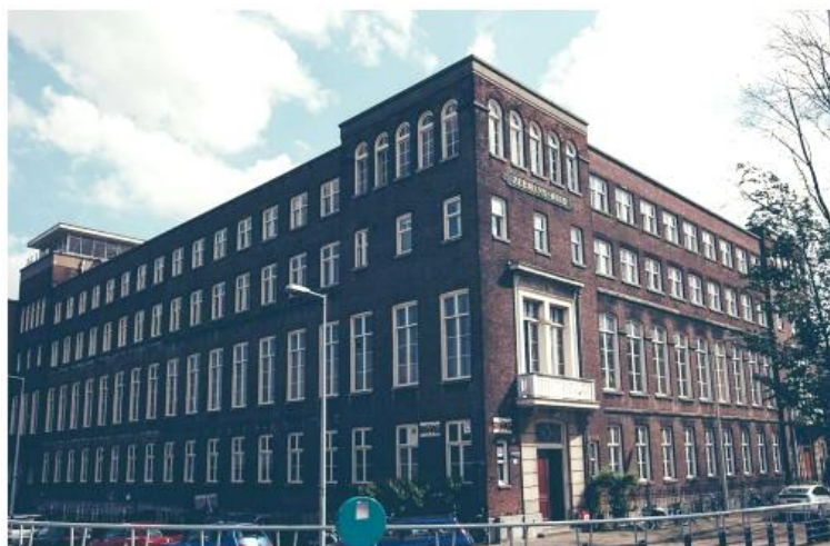
This is the School of Biblical Studies in Amsterdam, the Netherlands. Though I have been to this campus previously, this year all the lectures were on-line using Zoom.

In mid-February, my final lecture for the winter was for U. of N. students in Amsterdam, the Netherlands. This was a delightful bunch of Europeans, mostly Dutch, but with a few others as well. Here, I covered the Book of Joshua, which has its share of technical challenges archaeologically, historically, and theologically.