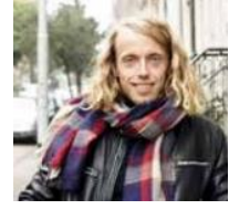
Dian, the Netherlands