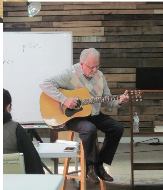
Since it was Advent, I brought my instrument and began each day's lecture with a guitar Christmas carol.

After I explained Greco-Roman customs for married women's hair-coverings in the 1 st Century—more or less the equivalent of the modern wedding ring—she was quite delighted to discover a better reading of this NT passage. Unlike several of my recent lecture outings, this one was in English with no need for translation, so it was smoother than usual.