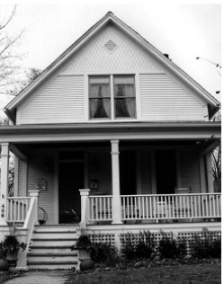
Farmhouse (Gable Front)