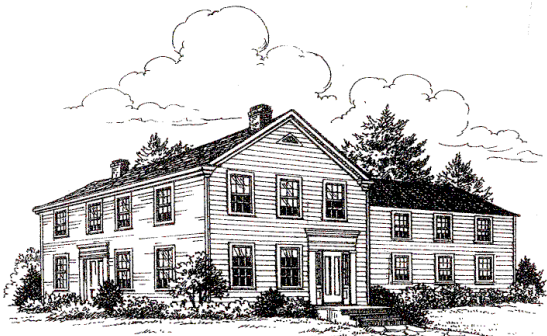
Stacy's Tavern Museum

Requests for plaquing of a structure may be made in person at the History Center, by submitting a letter via USPS or by email. Include the address of the building and the name and contact information of the current owner.