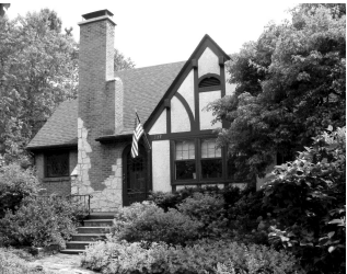
Kit Houses from Sears and Wards (variety of styles)