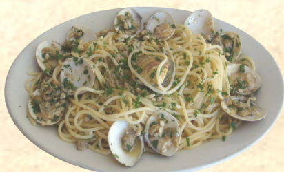
Spaghetti w/ Clams