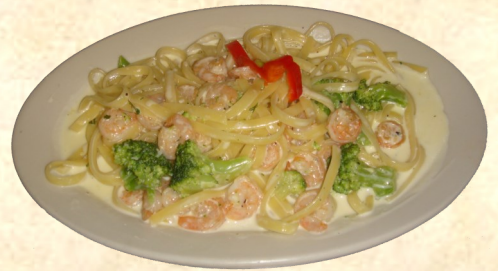
Fettuccine alla Shrimp

Baby & Shelled Clams sautéed in a garlic, herbs, white wine sauce (marinara sauce optional)