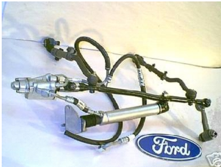
Mustang Power Steering System

If a 1965-1970 Mustang had optional power steering, it was the hydraulic ram type. These power steering systems have been much-maligned over the decades. Typical complaints include leaks, too much boost and not enough road feel. I've heard many early Mustang owners insist they need to upgrade to an aftermarket power steering system. Depending on your needs, maybe. But maybe not.