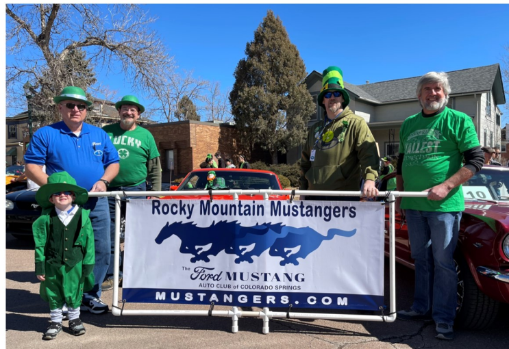
Club Members having a great time at St Patty's Day Parade!

Get more information on events at www.mustangers.com .