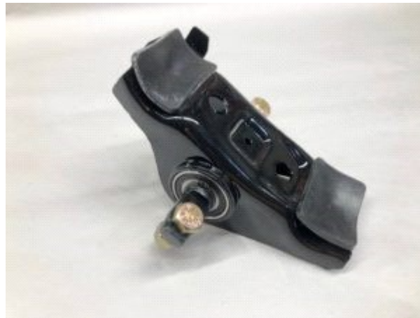
Roller Spring Perch

Roller Spring Perches - Early Mustangs borrowed much from the earlier Ford Falcon. The Falcon spring perches had bronze bushings, but to cut costs, Ford opted to use rubber bushings for the Mustang. These rubber bushings tend to bind and quickly wear out. "Roller" spring perches are now available with sealed bearings which work even better than bronze bushings and help the front suspension to move more freely.