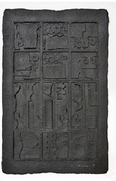
Louise Nevelson, Moon Garden , 1976 Intaglio 31 1/2 x 21 in. 80 x 53.3 cm.