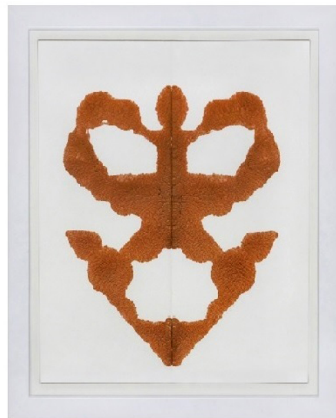
Gregg Louis, Shadow No. 1 , 2012, sunless tanning lotion on paper 14 x 11 in. 35.6 x 28 cm

PAPER, an extraordinary opportunity to explore artworks by historical and new artists. Today's visual world, dominated by technology, often forgets about the original materials, whether it is through a book, a photograph, a letter or a work of art. An experience involving all of our senses, and not just our vision, is encouraged through this exhibition, on view at Nohra Haime Gallery from July 9 th , 2014 to September 8 th , 2014.