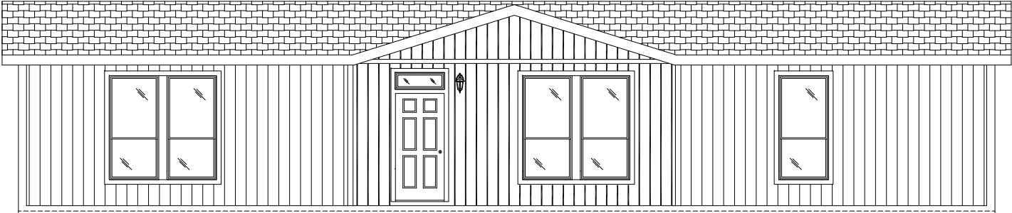
FRONT SIDEWALL W/NOMINAL 20'-0" DORMER