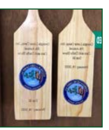
Picutre of car trophies

Caping off the Friday evening events was a hay ride. Campers sang Christmas songs as they traveled around the camp. Never a dull moment when this group gets together.