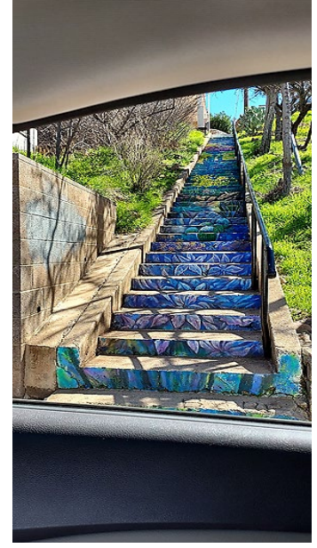
staircases. Looking for the stairs from the car presented a challenge for the couples. Retelling their

Everyone stopped by the Pickle Barrel for souvenirs, then the Eells and Gould's took the local map provided and went in search of the Stairizona Trail. The city created an in-town hiking experience using the hilly terrain and staircases that had once been used by miners. The staircases were cleaned up and murals were painted on each providing routes for hikers of all