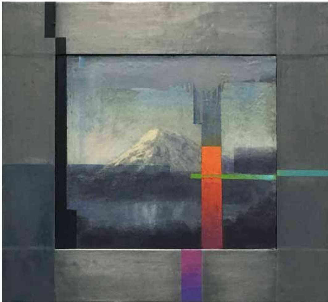
VOLCANO GLITCH, 201, oil on jute adhered to canvas, 48 x 72 x 2 in. 122 x 183 x 5 cm.