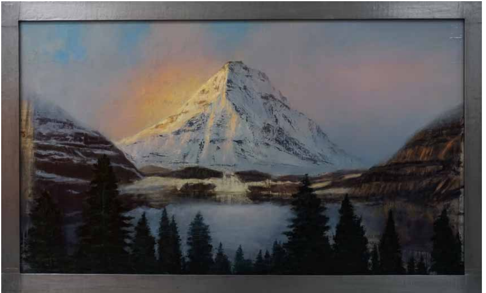
OUT OF PARADISE BRITISH COLUMBIA, 2020 oil on newspaper and shopping lists adhered to paper adhered to wood, framed in lead, 38 x 63 x 2 1/2 in. 96.5 x 160 x 6.4 cm.