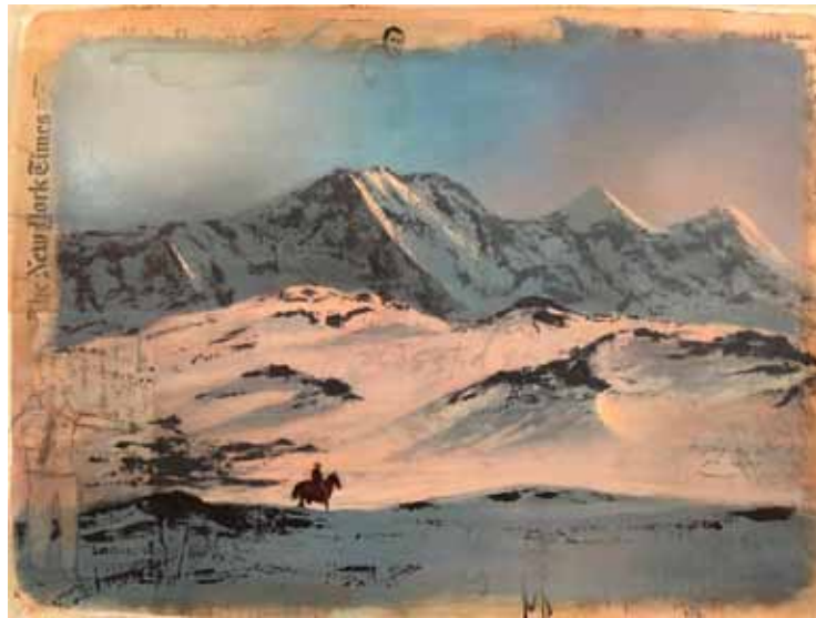
BIG ROCK CANDY MOUNTAIN, 2018, oil on paper, 22 x 30 in. 55.9 x 76.2 cm