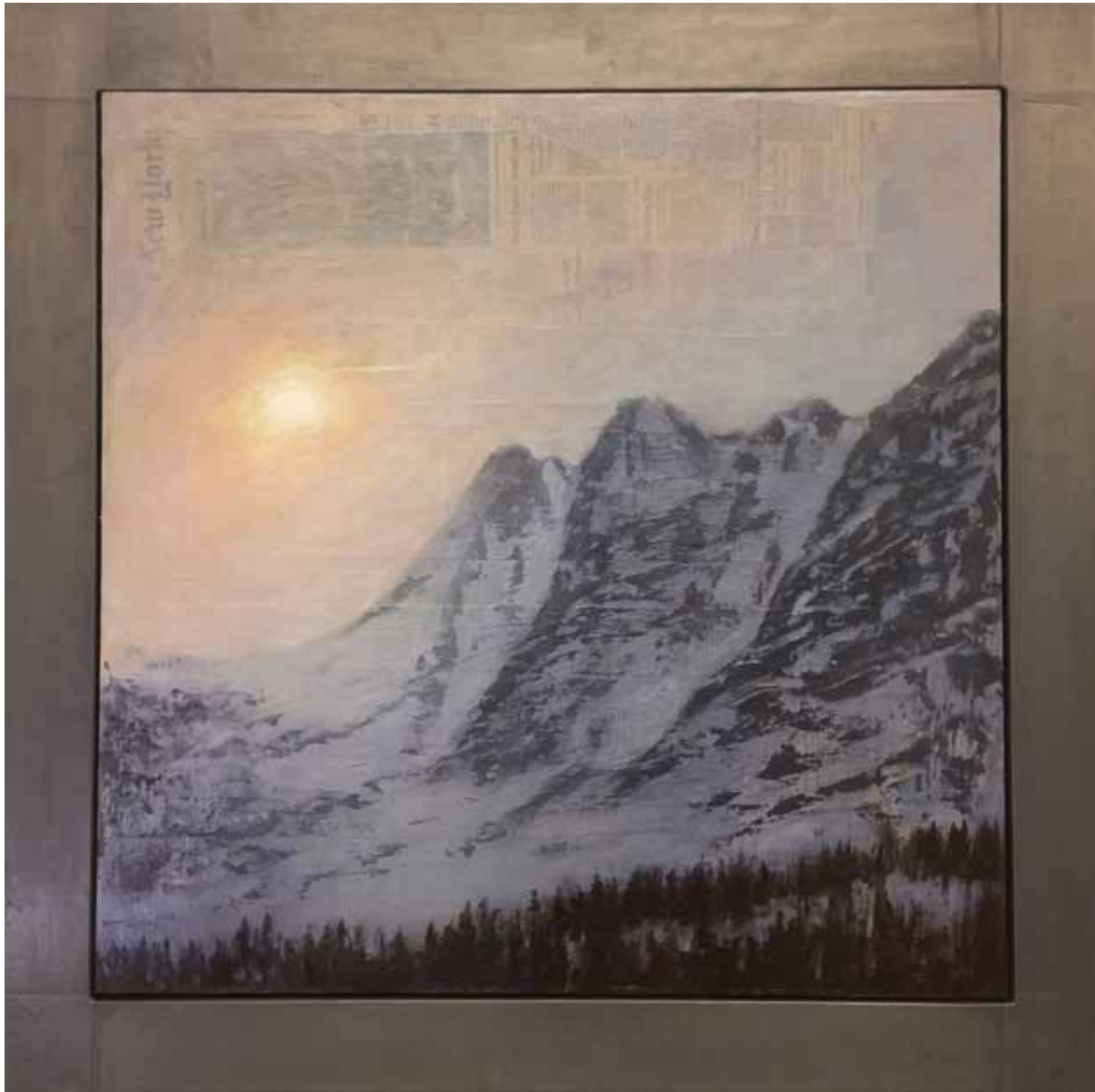
OLD NEWS MAJESTIC 2017 oil on newspaper adhered to canvas encased on lead, 24 x 24 x 2 in. 61 x 61 x 5 cm.