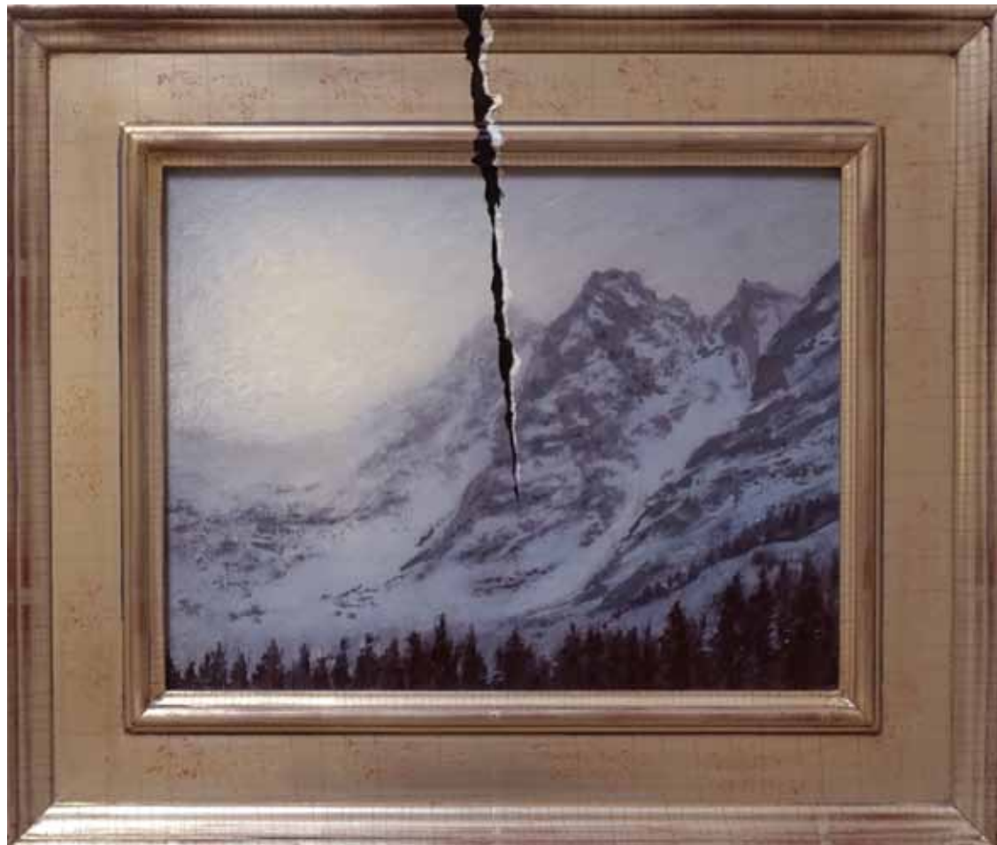
A CRACK IN THE MAJESTIC, 201, left panel: oil on canvas, right panel: oil on lead, 12 x 24 x 12 in. 30.5 x 61 x 30.5 cm.