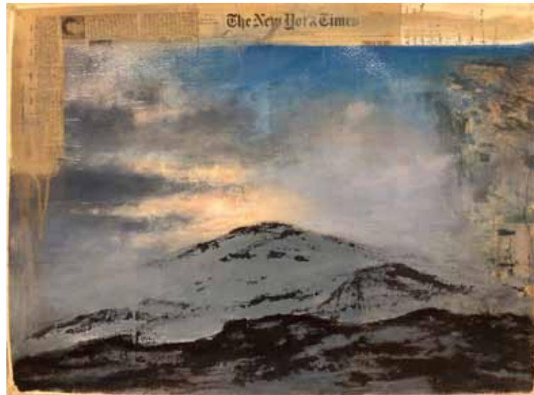
HOMAGE TO BOB ROSS, BANANAS, AND BAD NEWS, 2019, oil on newspaper and shopping lists transferred and adhered to paper, 22 x 30 in. 55.9 x 76.2 cm. THE SNOWS OF KILIMANJARO, 2018, oil on newspaper and shopping list transferred and adhered to paper, 22 x 30 in. 55.9 x 76.2 cm.