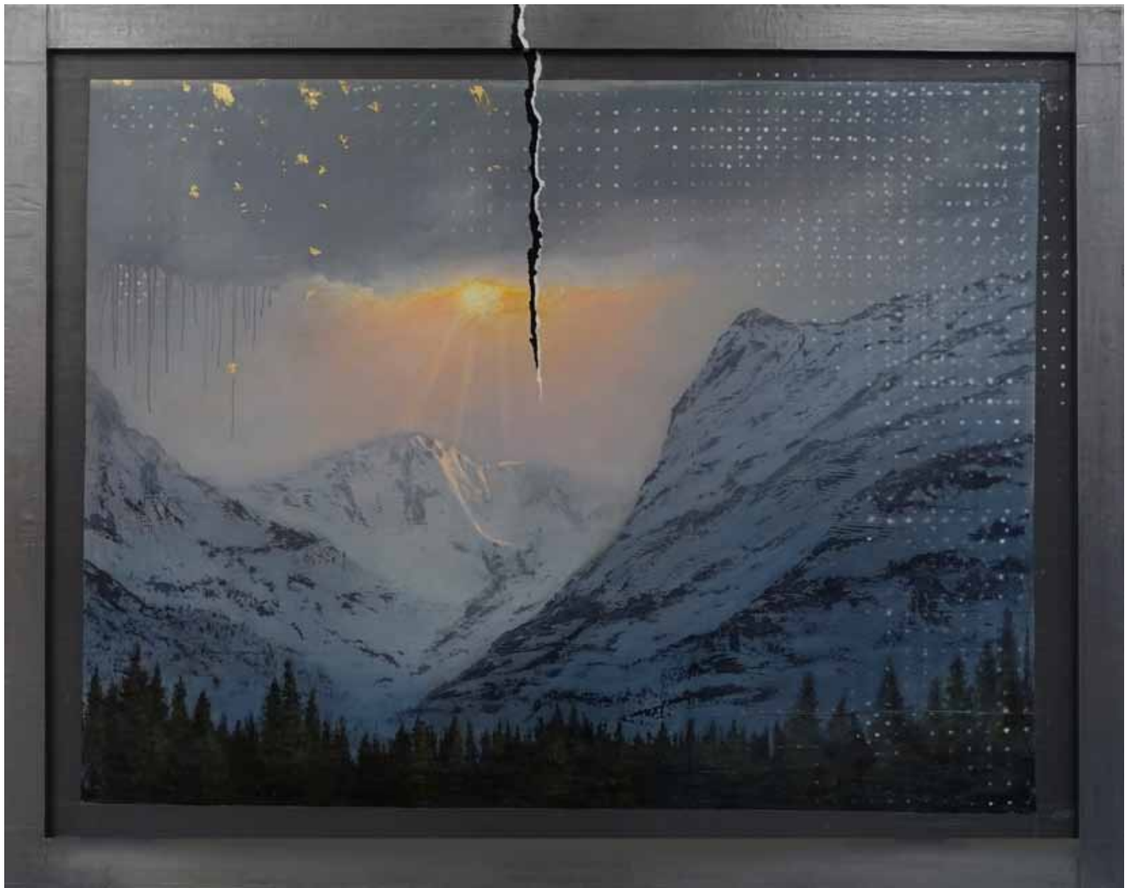
A CRACK IN THE MAJESTIC 2018-21 oil and metal leaf on newspaper adhered to canvas adhered to wood framed in lead, 49 x 62 x 2 in. 124.5 x 157.5 x 5 cm.