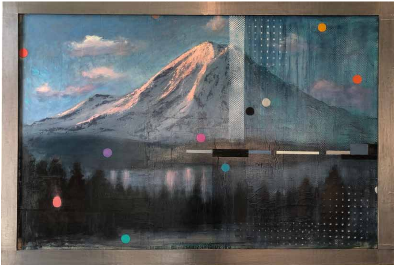
BIG ROCK CANDY MOUNTAIN 2018, oil on newspaper and shopping lists transferred and adhered to canvas framed in lead, 40 x 60 in. 101.6 x 152.4 cm.