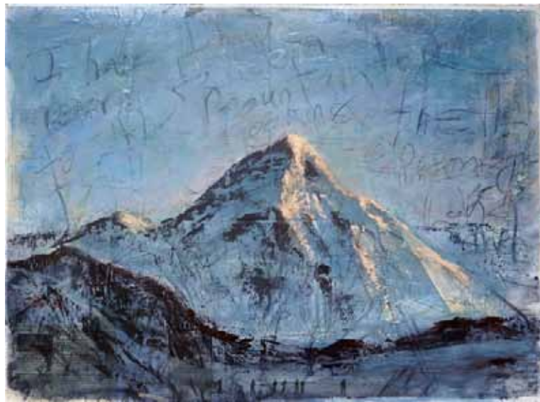
OUT OF PARADISE: BLUE RIDGE MOUNTAINS, 2020, oil on newspaper and shopping lists adhered to paper, 22 x 30 in. 55.9 x 76.2 cm. BEEN TO THE MOUNTAINTOP, STILL LOOKING FOR THE PROMISED LAND, 2018, magic marker, oil and graphite on newspaper adhered to paper, 22 x 30 in. 55.9 x 76.2 cm.