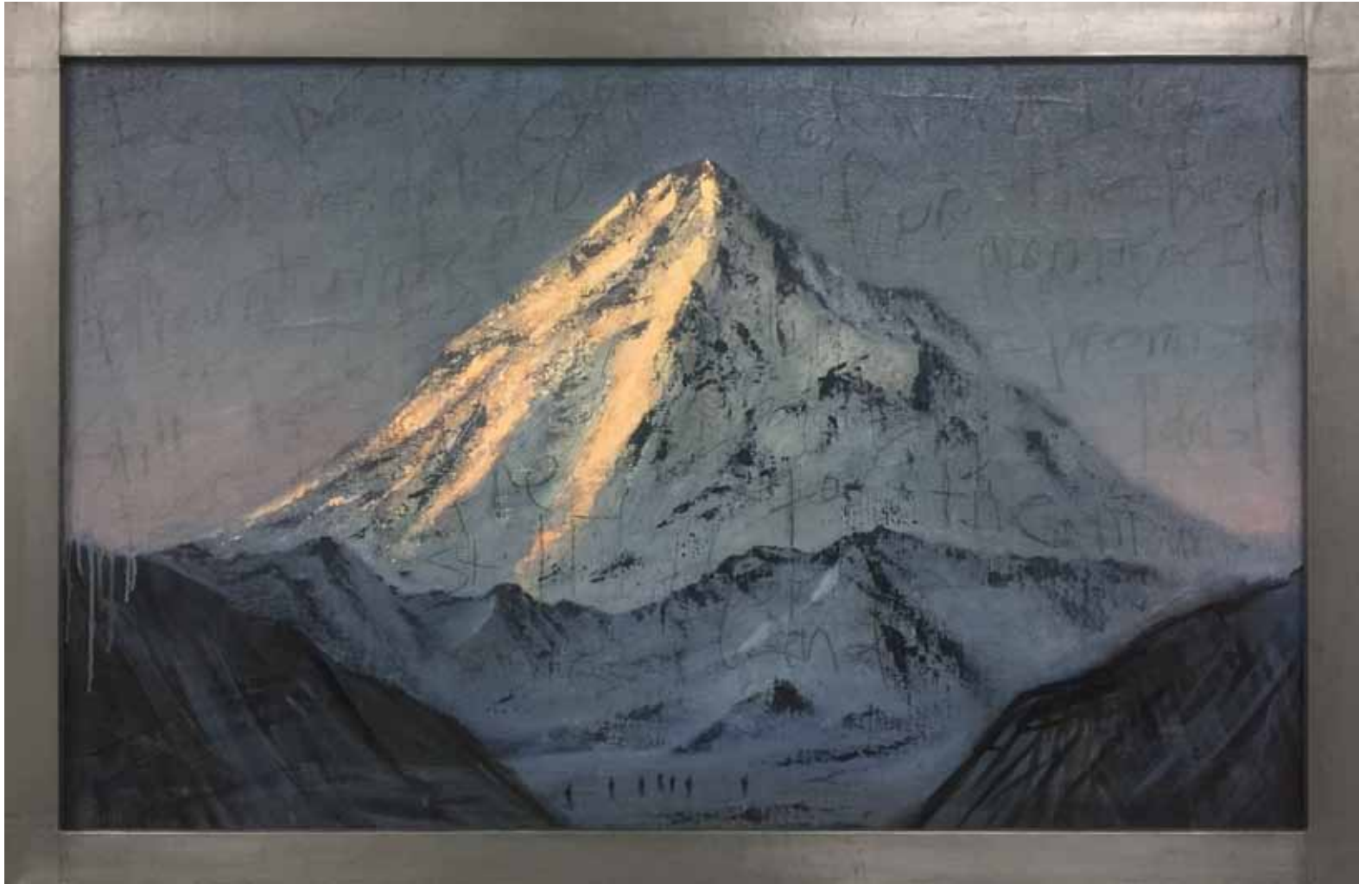
STILL LOOKING FOR THE PROMISED LAND 2018 oil on newspaper and shopping lists adhered to jute adhered to wood, framed in lead, 41 x 63 in. 104 x 160 cm.