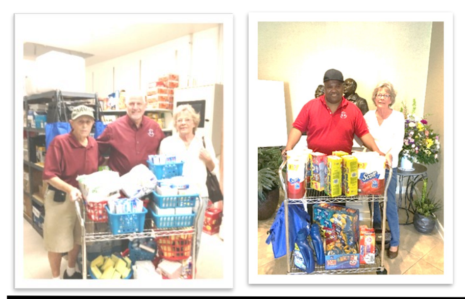
2018 – 2020 National Officers

Again, thank you so much for all that you have been doing to accomplish our goal. You are truly appreciated and valued.