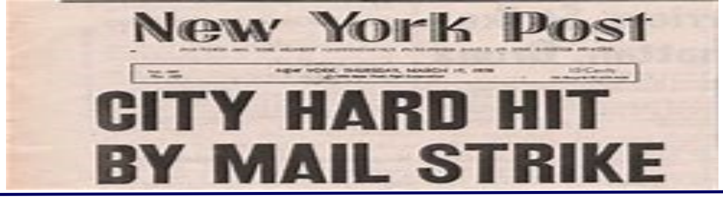
Auxiliary News and Views

disputes. After the strike, five postal unions joined all of these brave unionists and auxiliary members.