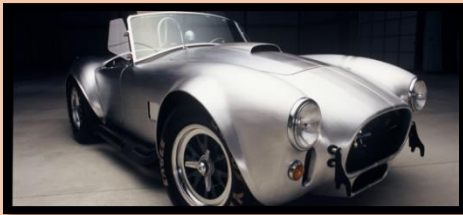
Brushed Aluminum 427 KMS/SC

If you ever wanted to own a 427 CI powered Shelby Cobra you will not want to miss this tour of the Kirkham Motorsports factory where they are producing Cobra replicas.