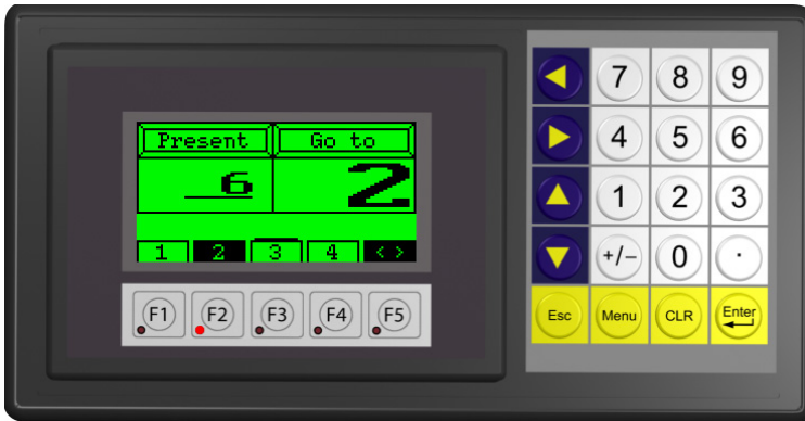
Operator Panel - OP3

* Base controller(s) may require Ethernet interface option