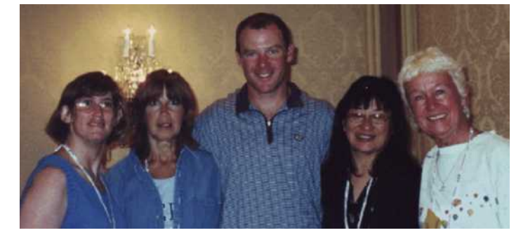
Party with Olympian A.J. Kitt at FWSA Convention held in Phoenix, AZ in June 2000.