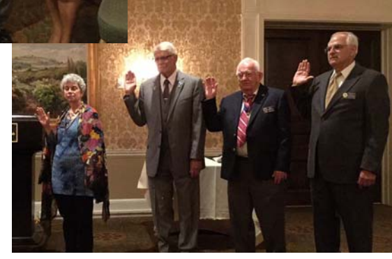
"I promise to ..."