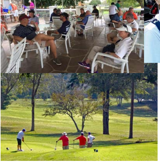
Waiting for the "Hole -in-One"