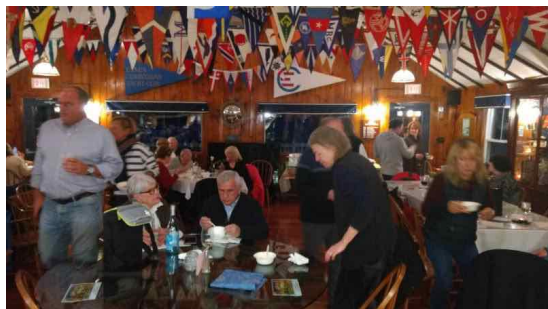
A nice crowd at our first Chili, Soup & Stew Cook-Off!