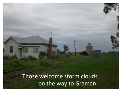
Those welcome storm clouds on the way to Graman

Next morning we set up our book table and prayed for 9 then on to Ashford in the rain. We prayed with 3, standing in the rain with T, because of the joy of seeing the rain at last. At Inverell we prayed for 9, 2 of whom took the drought prayer. At Gilgai we door-knocked and prayed for W and at Tingha we prayed for 5 who were aboriginal young people. We then drove to Bundarra and prayed for 3 who were interested in the drought prayer and also willing to take the blessing in the Holy Spirit prayer. Then we drove to Uralla for the night and prayed for G, the owner of the motel.