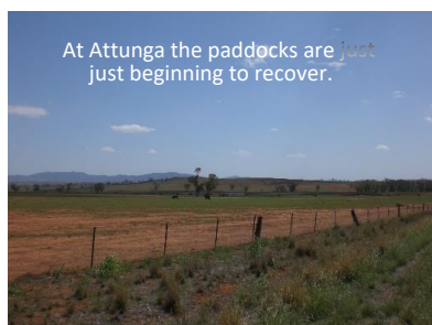
At Attunga the paddocks are just beginning to recover.