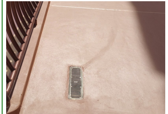
Before & After Crack Repair