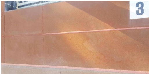
After Crack Repair & Caulk