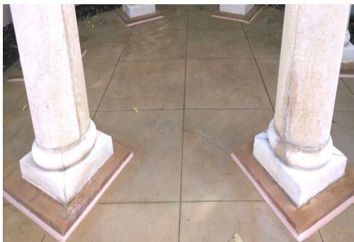
Before & After Caulk

When installed, our fast drying Restore USA Caulk can be walked upon within minutes & also comes in Popular Custom Colors!