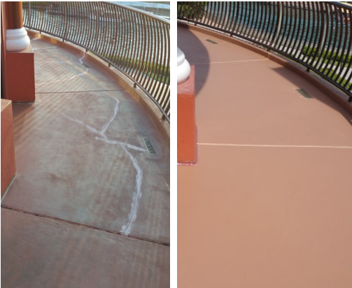
Before & After Crack Repair and Caulk

Restoration Specialists of Florida provides Application and Consulting Services for Caulk & Concrete Crack Repair to save you time & money.