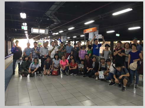
Family Bush Walk Activity —March 2019