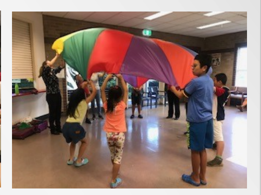
FHC & Music