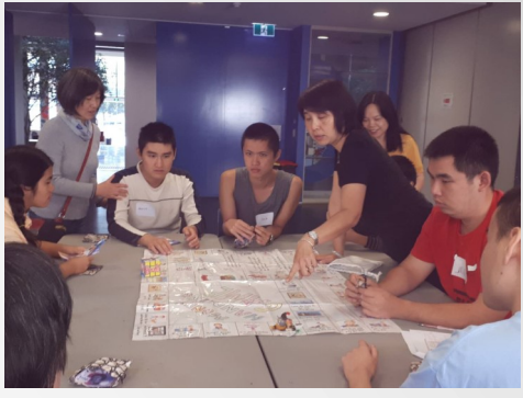
Money Handling Workshop