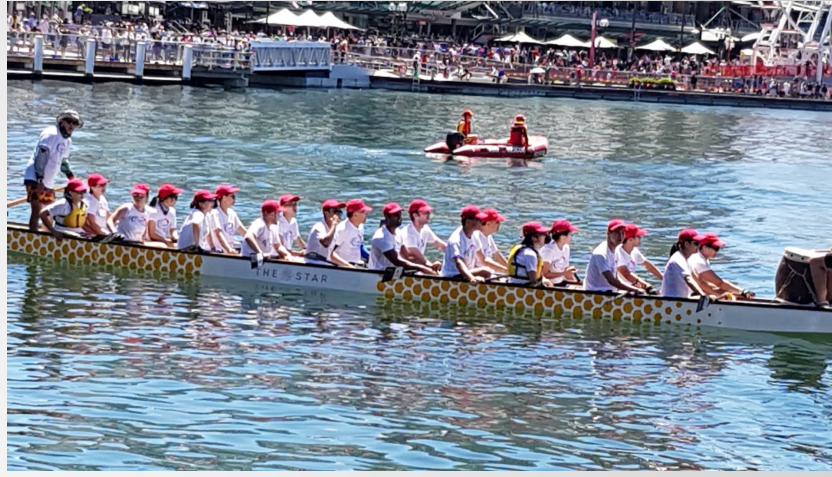
Dragon Boat Race 2019