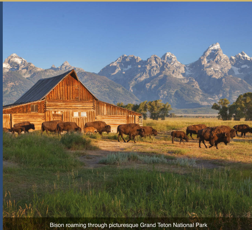
Bison roaming through picturesque Grand Teton National Park