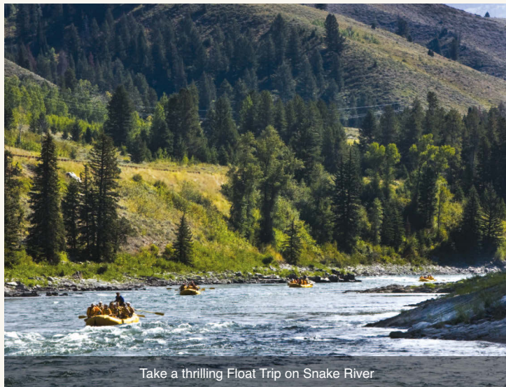
Take a thrilling Float Trip on Snake River

After breakfast transfer to the Salt Lake City International Airport for flights home anytime today. Meal: B