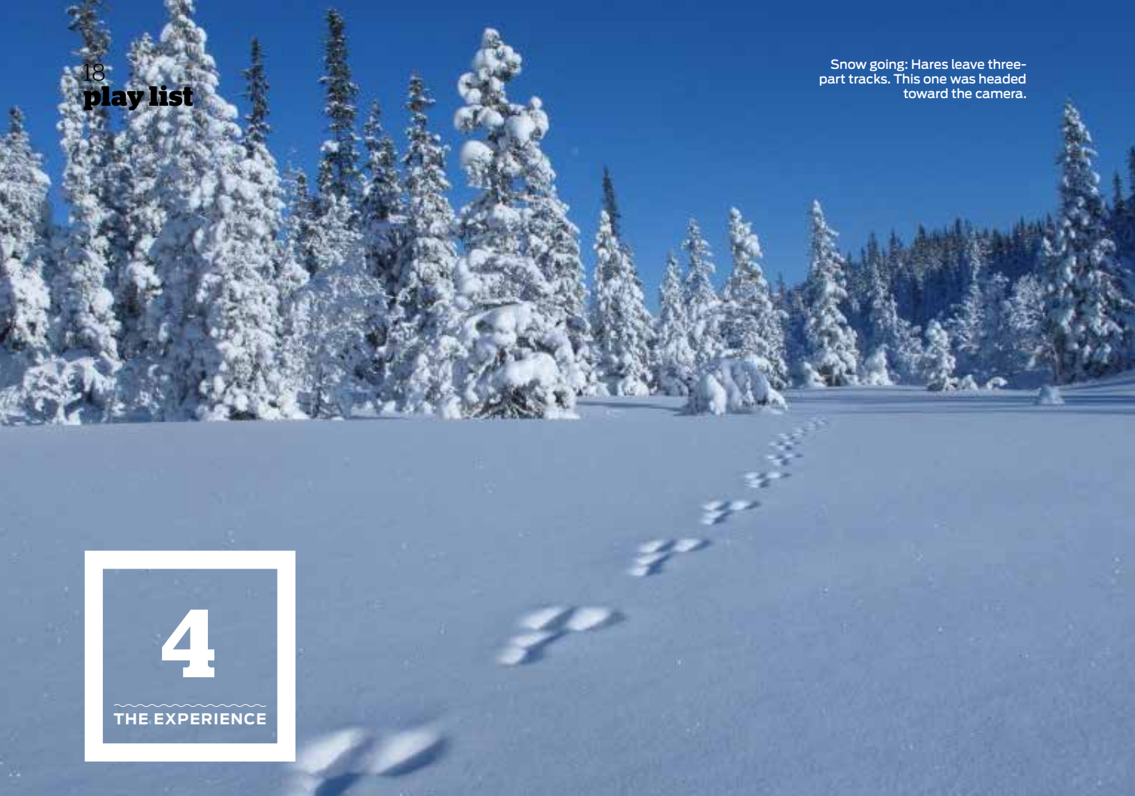
Snow going: Hares leave three-part tracks. This one was headed toward the camera.