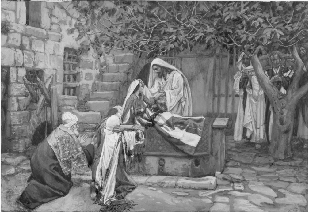
James Tissot, 1886