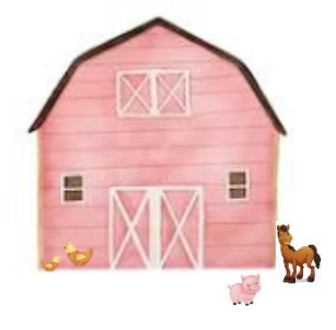
July 7 - July 11 Farm Week

Hop on board the hay wagon and join us as we learn fascinating facts about farms and the many types of animals that live and work on them. We'll sample farm fresh fruits and vegetables and learn how farmers plant the fields, harvest crops and bring food to the dinner table. With fun activities, books, and crafts we will all be aspiring farmers and move & groove to animal themed songs!