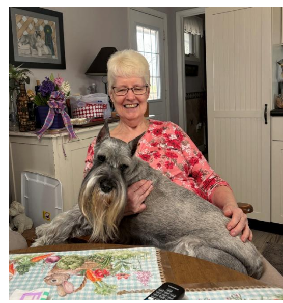
Job done! Relaxing now!