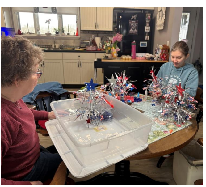
Table decoration challenge