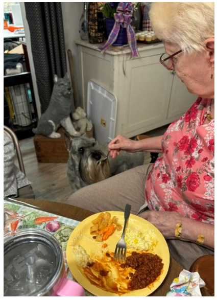
Guess who gave in to pleading eyes?!