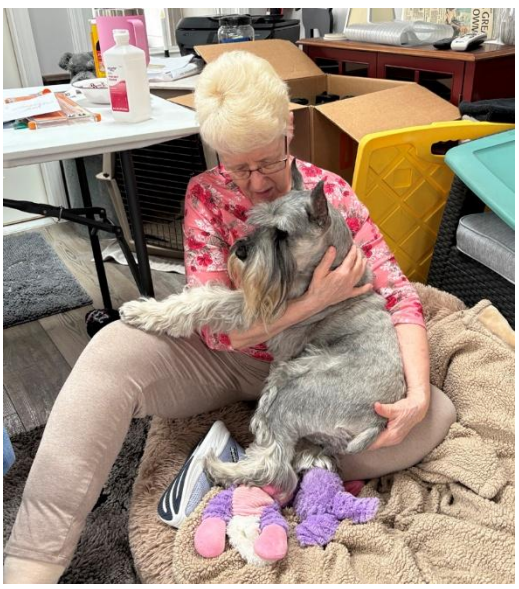
Even bosses need some snuggles