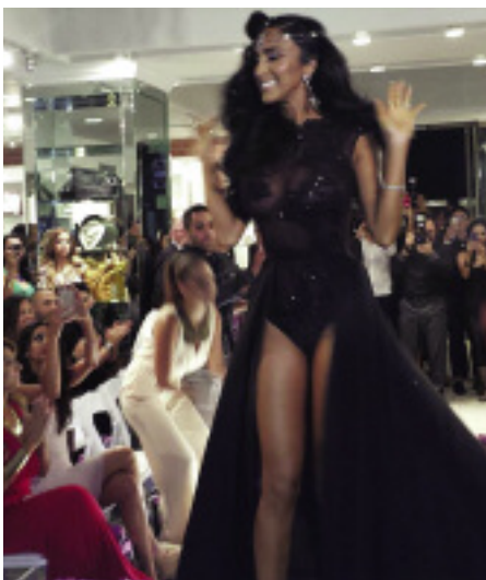
Lilly Ghalichi on the runway