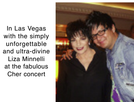
In Las Vegas with the simply unforgettable and ultra-divine Liza Minnelli at the fabulous Cher concert