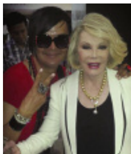
At the W Hotel in Los Angeles with my favorite comedian of all time on planet earth Joan Rivers for Jennifer Lopez's Hollywood Walk of Fame event.