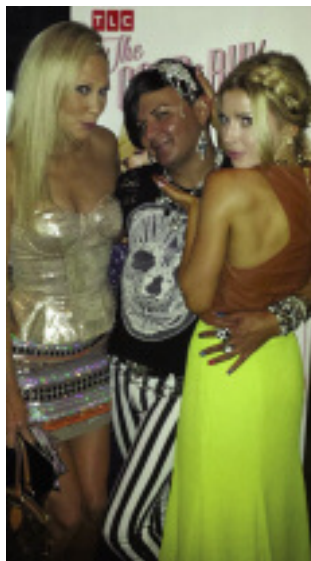
With my hair & make-up clients at the premier for the Goodbye Girls on TLC (I was on the show too!)