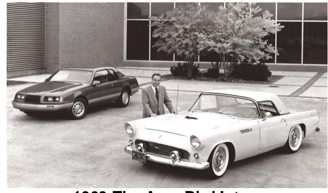
1963-The Aero Bird Intro

10/1/15 Henry Ford Hospital opened 10/10/15 The 1 millionth Model T was built 10/8/17 First Fordson Tractor was built 10/21/27 First production of the Model A 10/24/38 Mercury introduced 10/3/56 Introduction day for 1957 TBird 10/4/57 First Edsel was sold 10/8/59 Falcon went on sale 10/13/60 Ford Econoline trucks introduced 10/17/55 First 1956 Tbird was assembled