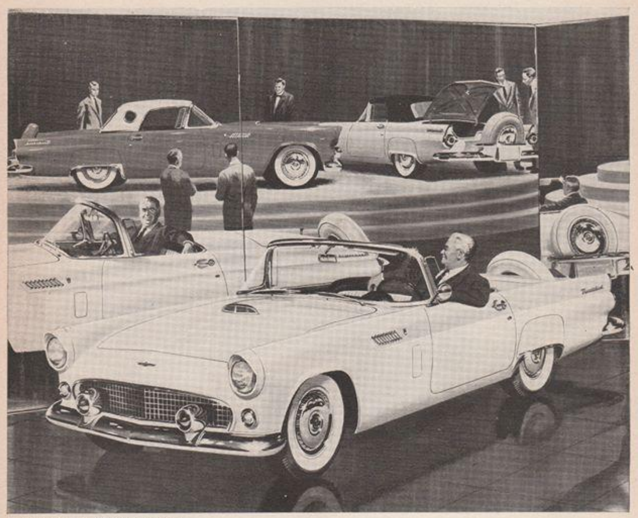
It hits tedium like TNT hits confetti.