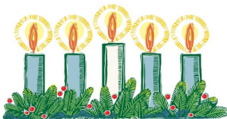
Wednesday Advent Services

Come December 23 at 7 pm and take a time and pray thru the chaos, confusion, and concerns of 2020 for the final Advent worship service as we journey towards Christmas.