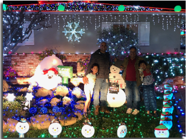
Above: Best Themed Award, 1022 Lafayette St. Above R: Griswold Award, 18 Kent Ct. Right: Classic Award, 2065 Texas Way