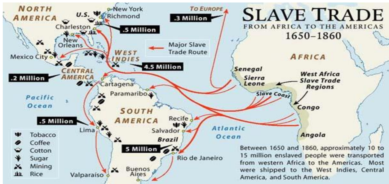
Slave Trade Routes to the Americas

Accompanying white explorers to the New World is the practice of slavery -- a scourge that is common across the world in the 17 th and 18 th centuries.