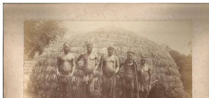
African Tribesmen in Front of Thatched Hut

Between 1600 and 1800, roughly 11 million blacks are transported from their homes along the west coast of Africa (from Senegal to Angola) to the Americas.