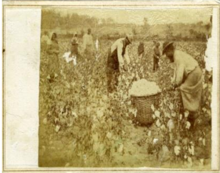
Slaves Harvesting Southern Cotton

The Southern commitment to slavery is evident in population data from 1775.