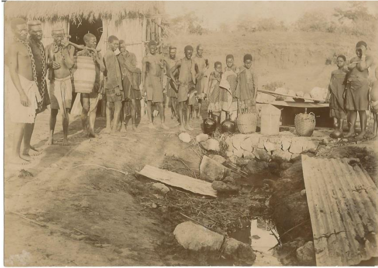
Chained Africans being Readied for Transport

Slave trafficking originates with deals between European agents (“factors/middlemen”) and tribal chiefs, who raid rival villages, round up families, rope them together in “coffles,” and drive them to collection centers, known as “barracoons.”