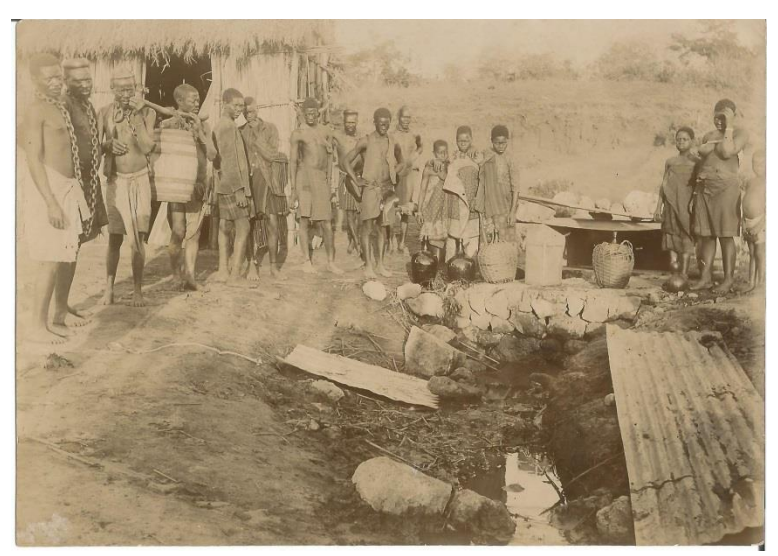
Chained Africans being Readied for Transport

Slave trafficking originates with deals between European agents ("factors/middlemen") and tribal chiefs, who raid rival villages, round up families, rope them together in "coffles," and drive them to collection centers, known as "barracoons."