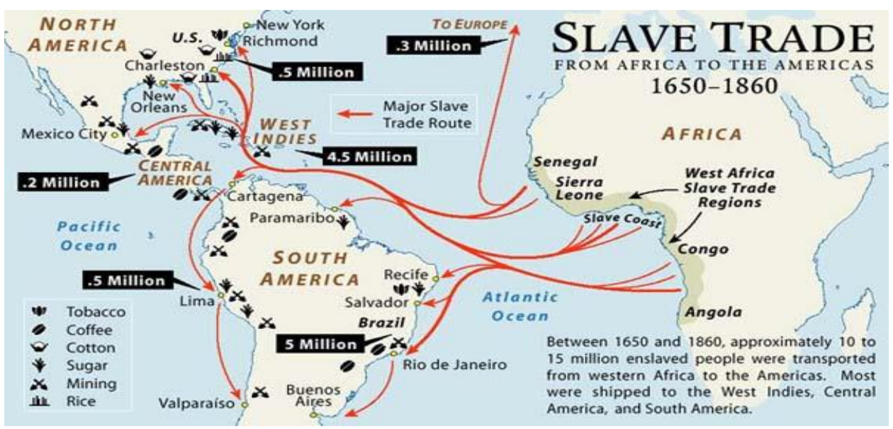
Slave Trade Routes to the Americas

Accompanying white explorers to the New World is the practice of slavery -- a scourge that is common across the world in the 17<sup>th</sup> and 18<sup>th</sup> centuries.