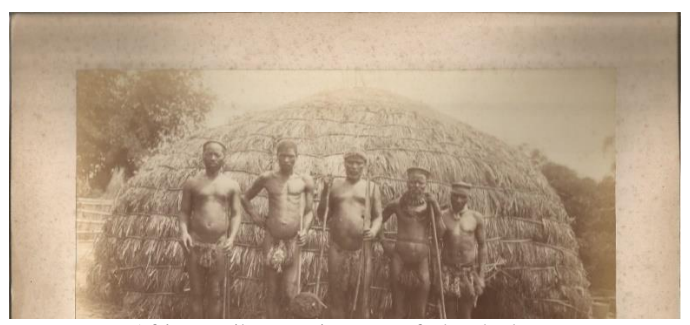
African Tribesmen in Front of Thatched Hut

Between 1600 and 1800, roughly 11 million blacks are transported from their homes along the west coast of Africa (from Senegal to Angola) to the Americas.