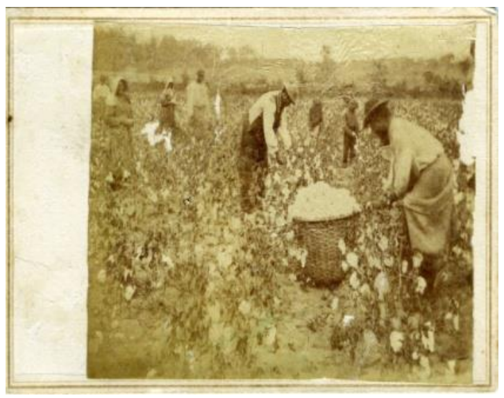
Slaves Harvesting Southern Cotton

The Southern commitment to slavery is evident in population data from 1775.