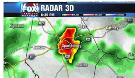
Downtown Spartanburg May 28 6:35 pm

This is what the band O'Neal Township had to say - "... after 4 songs in we got rained out. Monsoon rained out! I was just sick thinking about the boys instruments, and the city sound equipment. But you can't control mother nature! ...Thank you for all your support! " - O'Neal Township Facebook page