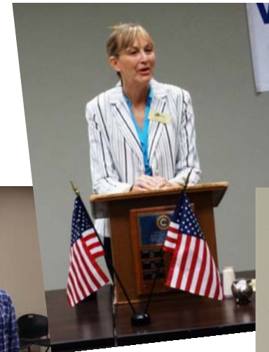
Speakers May 2015