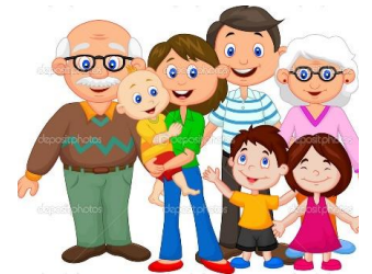
Spanish 3s and 4s