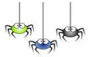
Science 3s & 4s