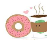
Donuts with Dad