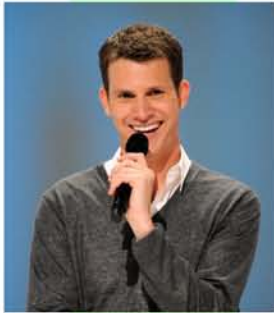
Stand-Up Comic, Daniel Tosh