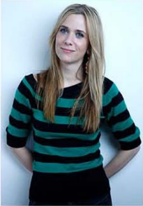
Comic Actor, Kristen Wiig