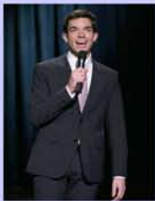
Comic, John Mulaney