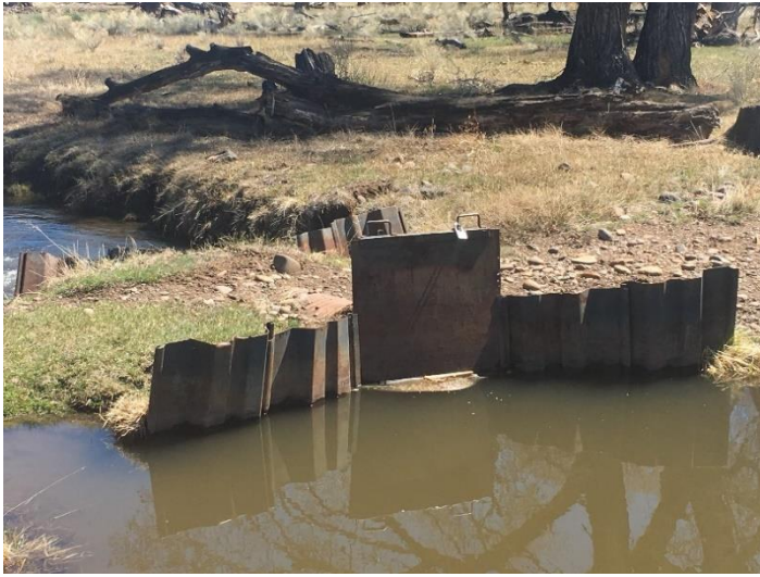
Headgate looking downstream