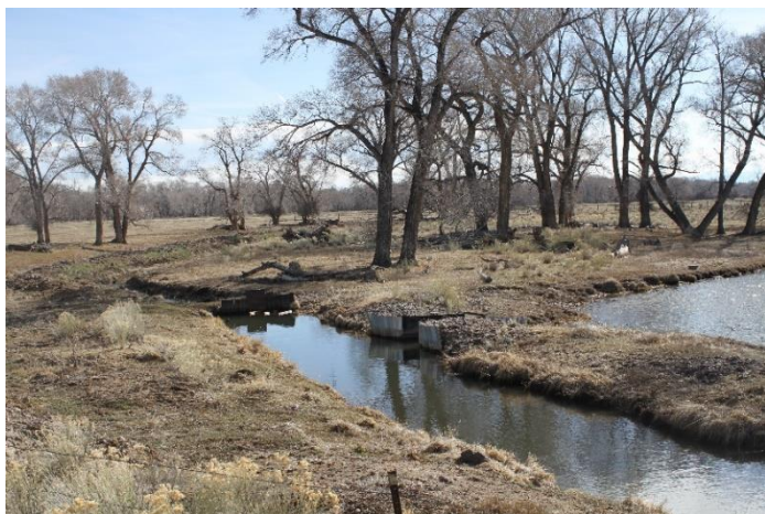
Flume looking downstream