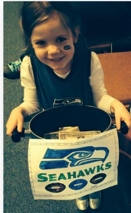
The Souper Bowl of Caring