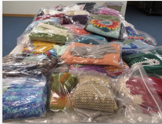
Winter Wear for the Food Bank