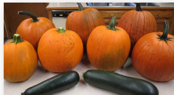
Harvest for the Food Bank