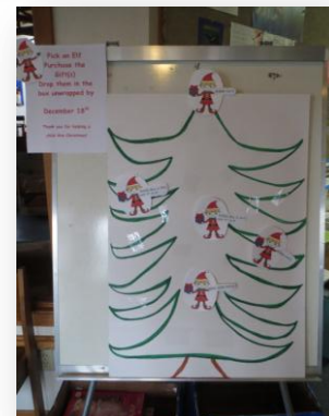
Elves for ECEAP Gift Drive