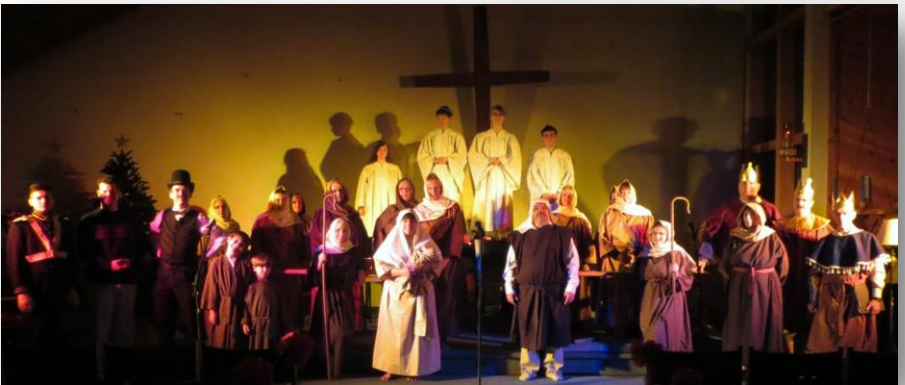
"Gifts of the Season"