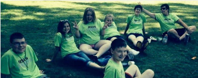
A moment to relax at Shoshone 2014