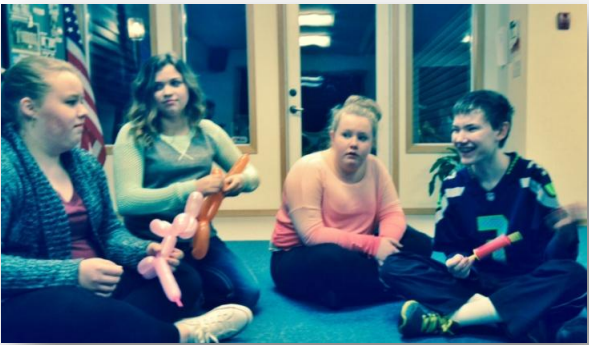
Wednesday Night Youth Group

This weekend gathering is planned and led by the SWWA ALYVE, a group of dedicated high school students from area churches who plan and lead events like this to give our students a chance to meet and hang out with other Lutheran students in Western Washington.