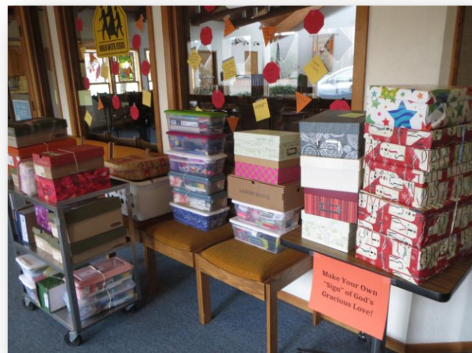
Samaritan's Purse Christmas Gift Boxes