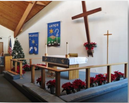
Ready for Christmas!

... and shared our 'Gifts of The Season' in a joyful Christmas Musical. The traditions of the church during this festive time are wonderful signs of God-with-us, Emmanuel, Jesus the savior born as a baby.