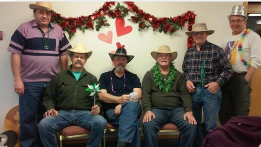
Senior Social Feb. 2015

Senior celebrations. The Valentine’s Day Senior Social with the men rockin’ their hats, and a nonagintennial shared with 102 Bethany Family members.