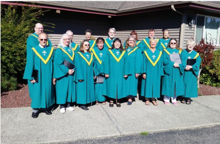
The Bethany Choir

.... cantatas during Holy Week and Christmas. Last year, we took a big step out of our comfort zone as we tried something new - a Christmas musical. Most of the choir was new to “the stage,” but stepped up to the challenge and had a great experience playing to a full house! Some of our members are retired and travel, some sing with other choirs, some are snowbirds, so our numbers are always changing, but we make it work. New recruits are always welcome!