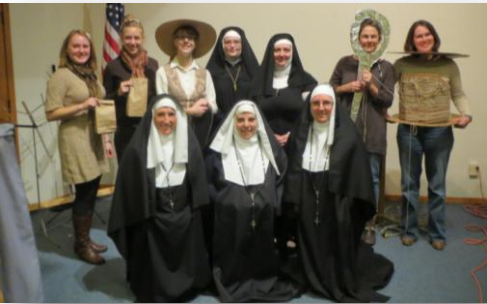
Sound of Music Sing-Along

Seahawks support. The 12th man worships here, and remember, Jesus had 12 men, too!