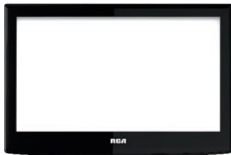
Bezel Design for 22", 26", 42" Models

Note: Features and specifications are subject to change without notice.