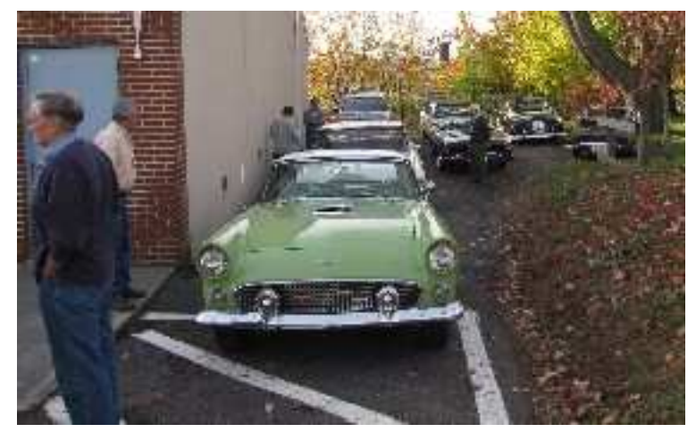
Don't let aging get you down...It's too hard to get back up.