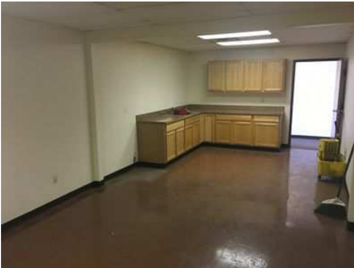
Airport Business Center 10400 sq.ft