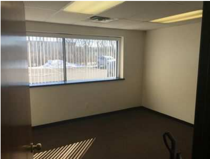
Airport Business Center 10400 sq.ft