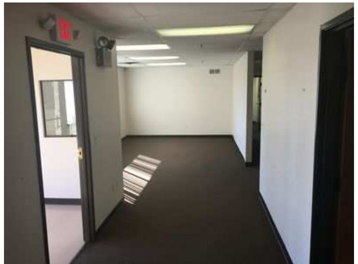
Airport Business Center 10400 sq.ft