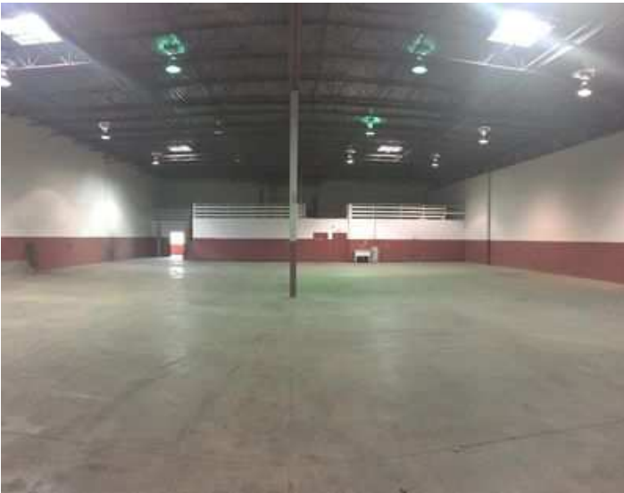
Airport Business Center 10400 sq.ft