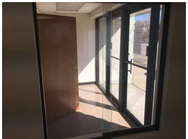
Airport Business Center 10400 sq.ft