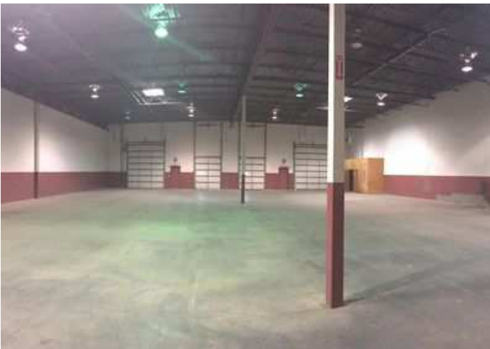
Airport Business Center 10400 sq.ft