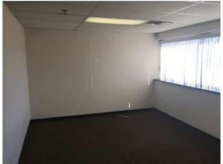
Airport Business Center 10400 sq.ft