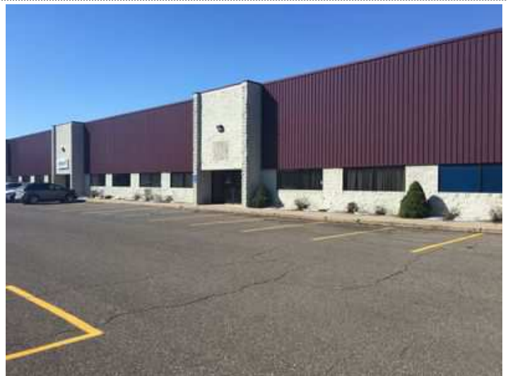
Airport Business Center 10400 sq.ft. (11)