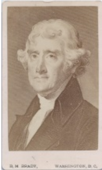
Thomas Jefferson (1743-1826)

State voting in the election of 1800 –extending from October 31 to December 3, 1800 – finds Adams and the Federalist Party in a state of disarray.