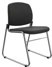
MX-2S A : 17" C : 18" E : 14"