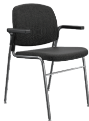
MX-4S A : 17" C : 18" E : 14"