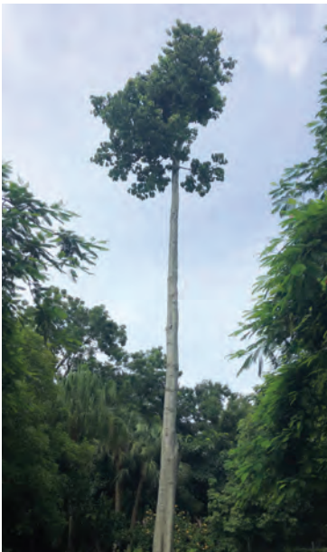
The Buddha Coconut (Pterygota alata) in the research gardens at Edison and Ford Winter Estates stands 85 feet tall and is one of the tallest trees on the property.

Edison and Ford Winter Estates is the internationally known winter home site of Thomas Edison and Henry Ford. More than 250,000 visitors walk through the location each year from all around the globe. The organization has received many awards, including the National Stewardship Award from the National Trust for Historic Preservation and the National Garden Clubs' Historic Preservation Award. The property is an official project of "Save America's Treasures," a Florida Historic Landmark and a National Register Historic Site. The Edison Botanic Laboratory is a National Historic Chemical Landmark. The site is open every day except Thanksgiving and Christmas from 9 a.m. to 5:30 p.m. and until 9 p.m. during the month of December for Holiday Nights.