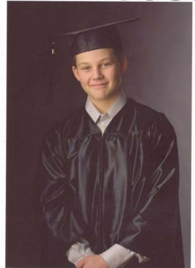
Youth Intervention Programs Help Youth Make The Right Choice!