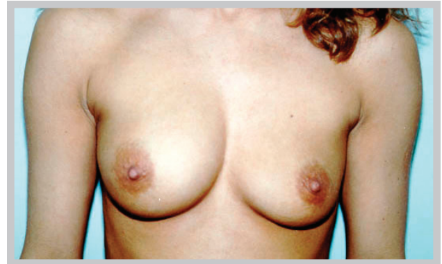
Photograph 2 shows a 29-year-old woman one year after having her silicone gel-filled breast implants removed. This is the same woman from Photograph 1.

One type of reoperation involves the surgical removal of your implants, which may or may not include implant replacement. As many as 20 percent of women who receive breast implants for breast augmentation have to have their implant removed within 8-10 years. Over the course of your life, you may need to have your implant removed due to local complications. Many women have their implants replaced, but some women do not. Women who do not have their implants replaced may have cosmetically undesirable dimpling, puckering, or sagging of the natural breast following implant removal.