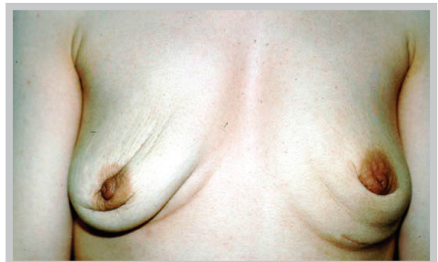
Photograph 3 shows deflated saline-filled breast implants in a 30-year-old woman.

Deflation occurs when the shell of a saline-filled breast implant tears or when the seal around the valve used to fill the implant is broken and liquid saline leaks out from the implant. When saline-filled breast implants deflate, loss of size or shape of the implant can be noticed immediately, or it may progress slowly over a period of days.