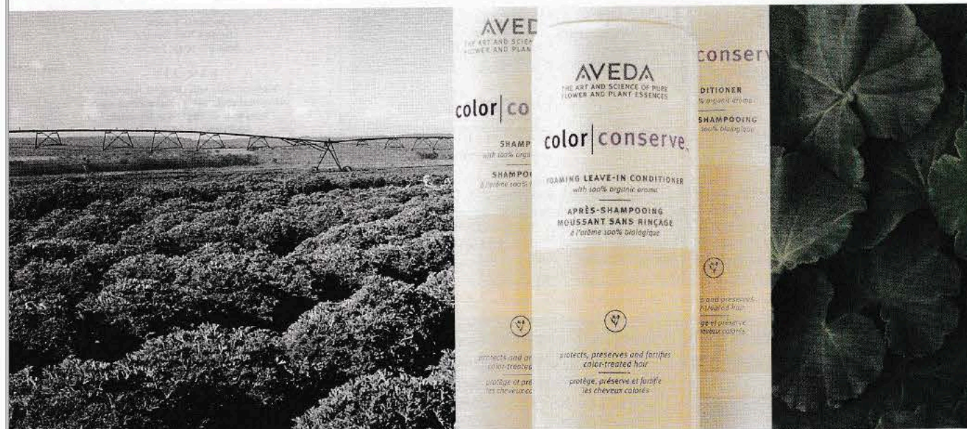
Above, certified organic rose geranium: on the farm, and in our Color Conserve™ hair care.

Our new Soil to Bottle SM traceability system allows us to follow and document, the lifeline of our essential oils—beginning with farms like the one in Vaalwater, South Africa that works with Aveda to grow certified organic rose geranium for Color Conserve™ and other products. Economically and culturally, the collaboration has fostered hope: giving local families a chance to come together again as a community—having been driven apart in former troubled times—and farm the land they have always lived on. It has helped create more jobs and build new homes for the families working there, as well as a daycare, a school and a badly needed HIV clinic.