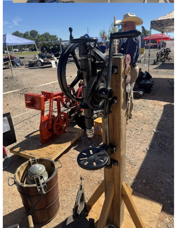
October 2025 Show Photos