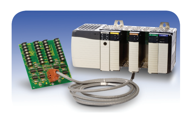
Automation system suppliers can often provide components that enable seamless connections from new controllers to existing I/O infrastructures, minimizing downtime during a DCS upgrade.

Once the operators are comfortable with the new HMIs, the simulation software can be uninstalled from the HMI PCs, and the PCs can be connected to the existing controllers. Depending on the DCS, this may necessitate some downtime, and may also require some programming to integrate the new HMIs with the existing controllers.