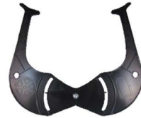
Rim Width Gauge 46FC77653