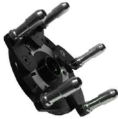
Pin Plate Adaptor Manual - 41FFA6478 Pneumatic - 41FFA5298