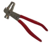
Weight Hammer 301400425