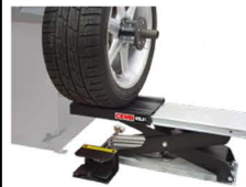
Pneumatic Wheel Lift 46FL85170