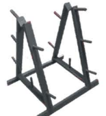
Accessory Rack 41FF03151