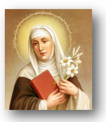
Feast Day: April 29

*Resident of Keyser Healthcare Center (135 Southern Drive, Keyser WV 26726)