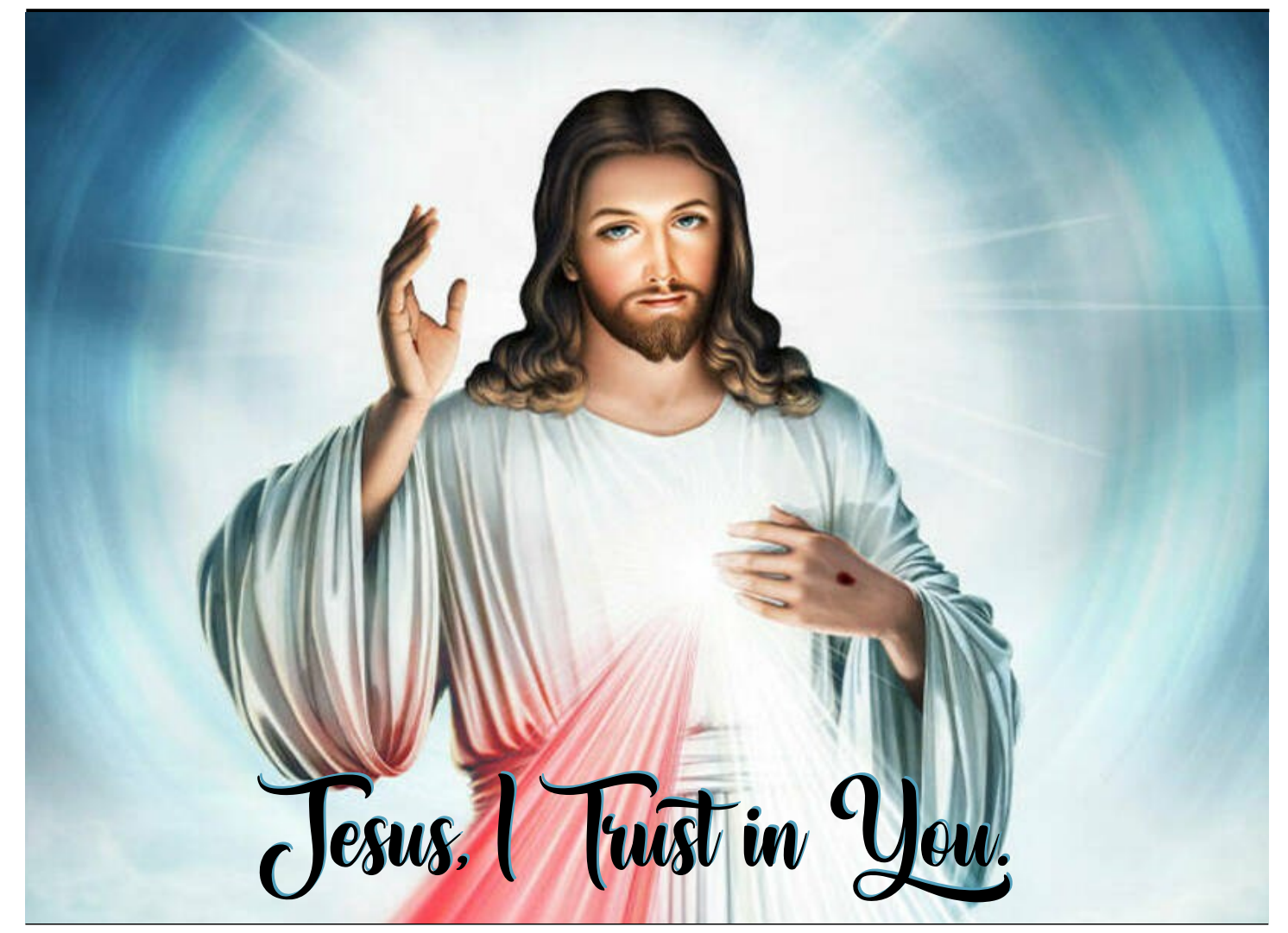
April 27, 2025