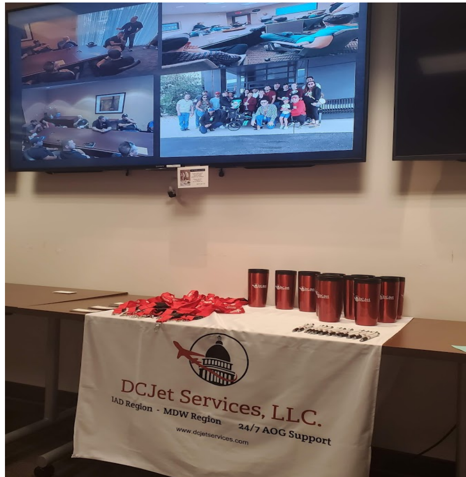
Meet and Greet at NetJets Headquarters

Well, for the first two months, no company was even close to us in performance. We are the only Service Hub to clear all the metrics. This caught the attention of all the higher ups at NetJets and new opportunities are arising. More info on that later. Hard work pays off and I want to thank you all for the effort.